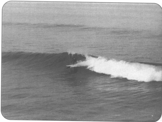
Down the line — This very rideable wave is peeling along its length in a uniform fashion.

The following diagram shows the forces involved in surfing. In effect, the surfer slips down the moving front of the wave under the influence of gravity. Correctly positioned and moving with the direction of the wave, the surfer travels at the speed of the wave crest. By traversing the face of the wave, the surfer may move even faster than the wave. The trick is to catch the wave as it passes so that the gravitational force on the board is greater than the resistance of the water. Ideally after a few strong strokes the surfer is propelled by the wave's energy.